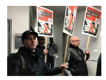
Filing of a petition and occupation of the office of the Minister of Justice David Lametti in Montreal.