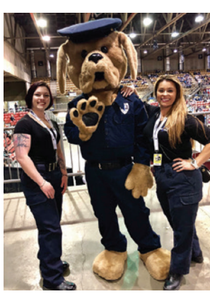
Outreach activity by members of Edmonton Institution for Women.

Grand Valley Institution correctional officers protest at MP Marwan Tabbara's offices in Kitchener, ON