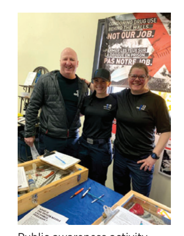
Public awareness activity in Truro, NS, with petitions signed and information leaflets distributed.