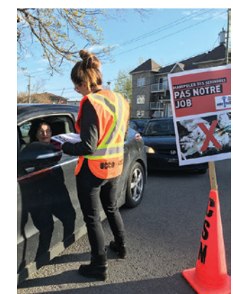
Public awareness activity in Joliette, QC, with distribution of information leaflets.